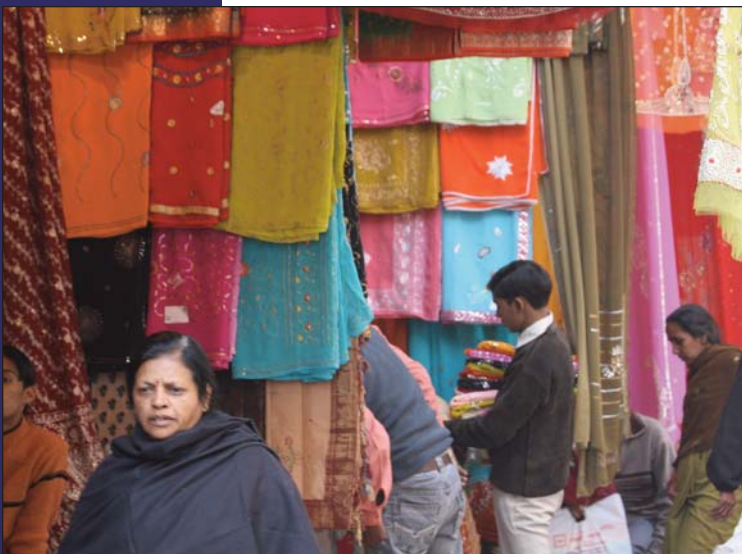
Dehli, India.